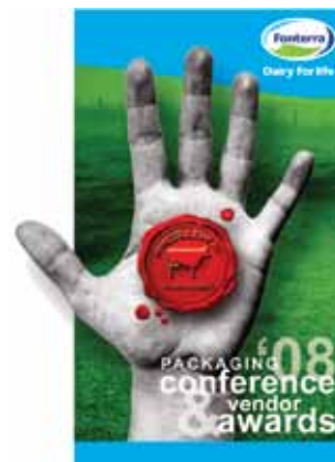
Multiple winner at the inaugural Fonterra Packaging Award

Partner this with our unparalleled service and support programs available all around the country, and you'll see just why Reynolds Group is the team you can depend on for your coding and labelling – time and time and time again.